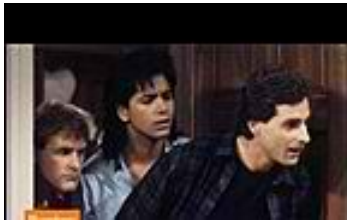
Bob Saget Admits 'Inappropriate Acts' in New Book Businessweek